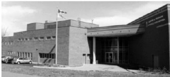
Lester B. Pearson Catholic High School

Hours of Instruction: 8:45 a.m. - 2:55 p.m.